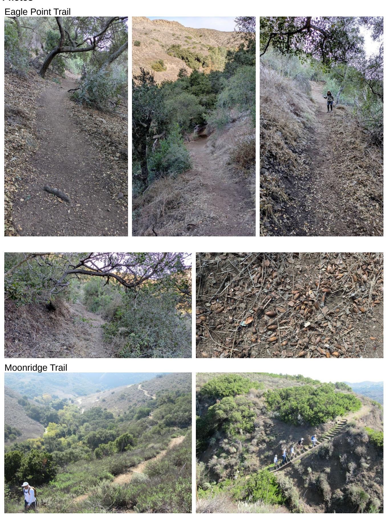
Take only photographs and leave nothing, not even tracks!