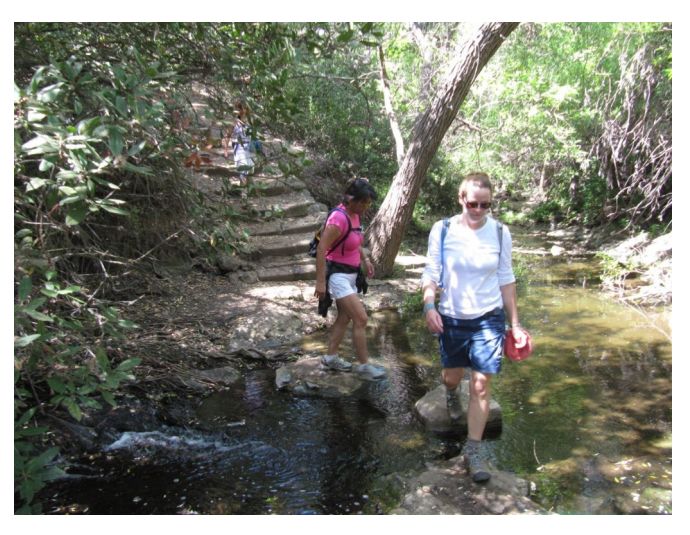
Wildwood Canyon Trail